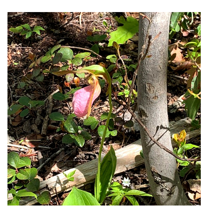
Signs of summer.